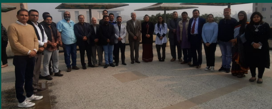
Date: 03rd December, 2023 Managing Non-Profit 2.0 @ New Delhi