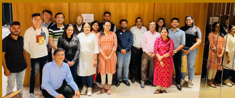
Date: 18th December, 2023 Managing Non-Profit 2.0 @ Ahmedabad