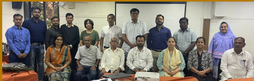
Date: 20th November, 2023 Managing Non-Profit 2.0 @ Mumbai