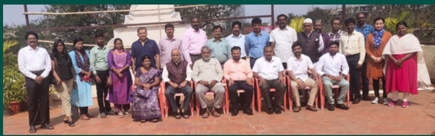
Date: 19th November, 2023 Managing Non-Profit 2.0 @ Bangalore